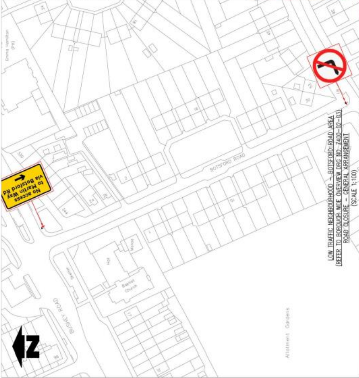
LOW TRAFFIC NEIGHBOURHOOD - BOTSFORD ROAD AREA (REFER TO BOROUGH WIDE OVERVIEW DRG NO. 2400-02-03) ROAD CLOSURE - GENERAL ARRANGEMENT (SCALE 1:100)