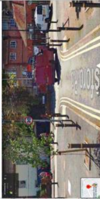
GOOGLE MAPS STREET VIEW